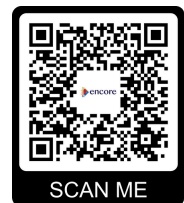
Exhibit support services needed: _____ Electrical outlet _____ Hardwire Ethernet Line Order these support services directly from the hotel via this link or scan this QR code.

NOTE: Booth assignments will not be made until payment is received. Multiple booths each require the exhibit fee. See last page for booth locations.